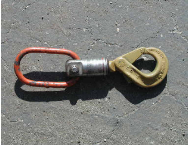
Figure 2, Load Closing Hook

Replacement due to attrition was the intended process for the “phasing out” of the older spring gate swivels, but this method does not appear to be working. A significant number of older swivels still exist within the cache system and the aviation community due to the robustness of the overall design.