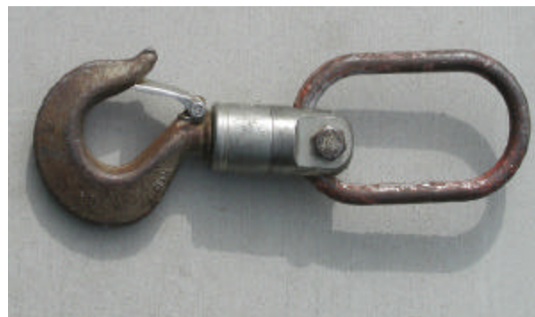
Figure 1 – Spring Hook