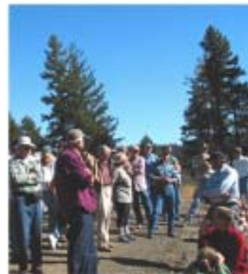
Squires Peak Field Trip. When neighbors come together for events such as field trips, new information is exchanged and the social acceptability of fuels management is reinforced.

One note of caution: Not everyone you need to reach lives in a neat subdivision or neighborhood. You must take care that the less affluent or poorly organized are not left out of education and communication efforts.