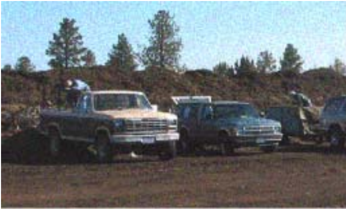
At a debris collection event in Bend, OR, neighbors model responsible fuels management and safely dispose of slash and other hazardous fuels.