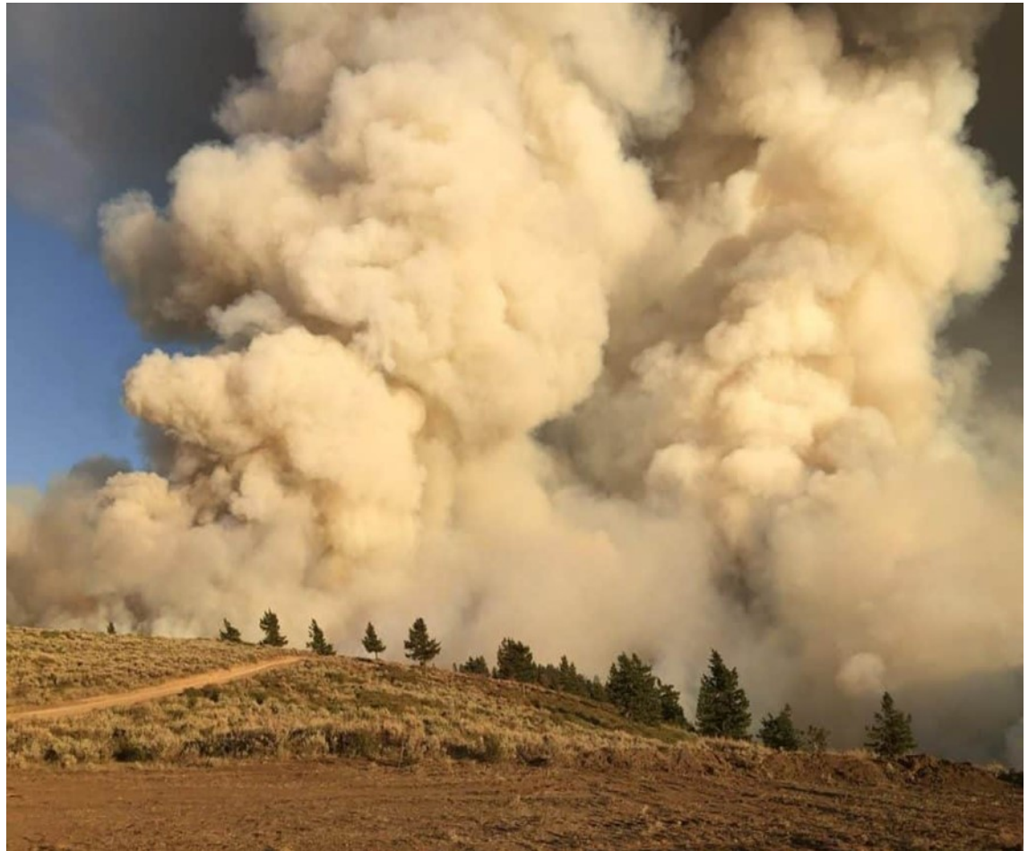
Pine Gulch Fire—Colorado 2020