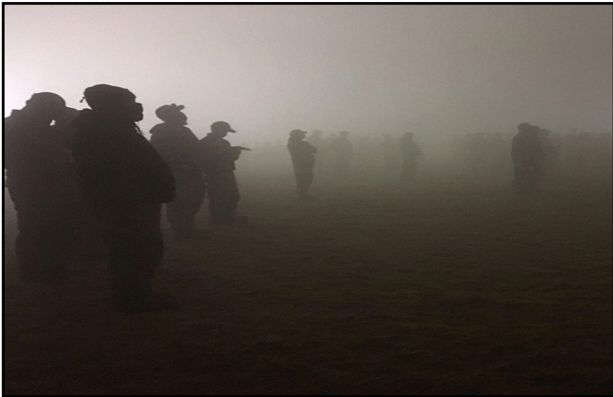
Firefighters standing in a foggy mist during a morning briefing on the Holiday Farm Fire in Oregon, 2020.